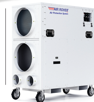
APS2000AB-ETL is shipped with grille panels installed and duct panels included